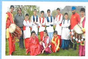
Nachdey Hasdey Arts Academy