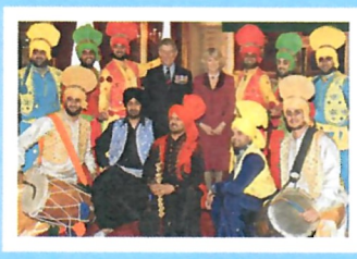
Gabhru Panjab De